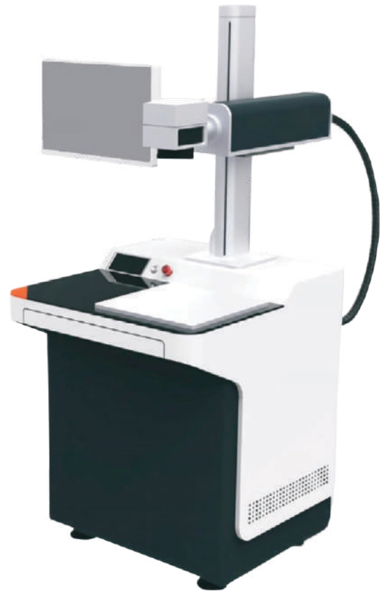
UV Laser Marking Machine