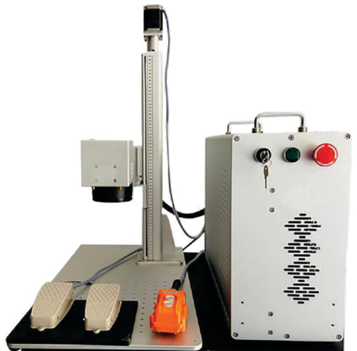
Table Top Model