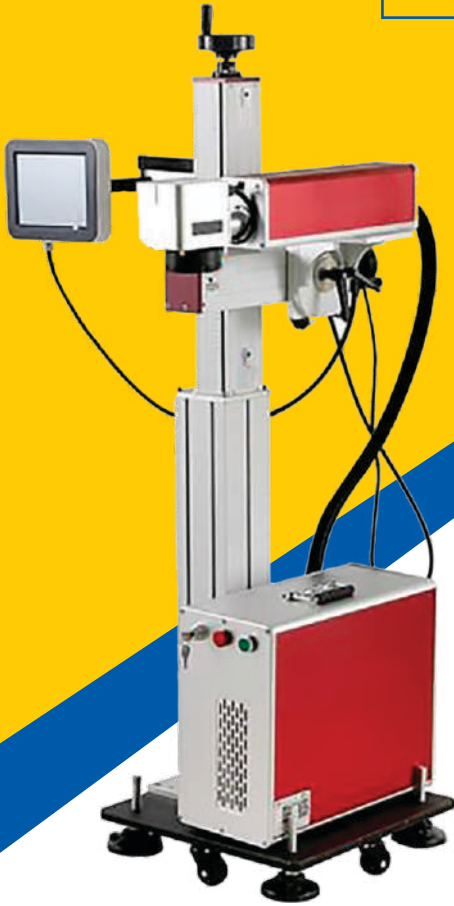
Fly Laser Marking Machine

FAST, POWERFUL AND RELIABLE LASER MARKING SYSTEMS