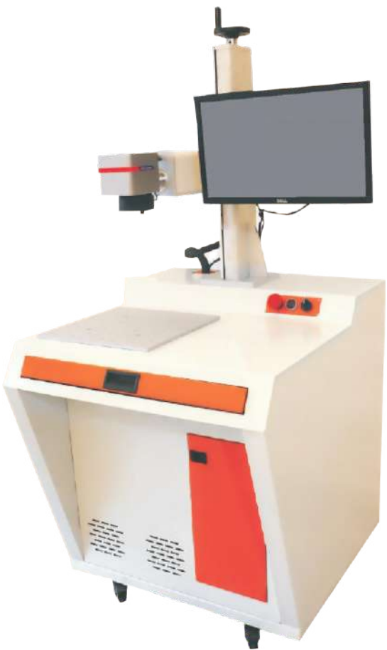
Co2 Laser Marking Machine

Laser Type : Co2 Laster Working Area : 600x900, 900x1300mm Average OP /Power : 80W (Optional 60x100, 150) Engraving Speed : 1-60000 min/mm Cutting Speed : 1-10000 mm / min